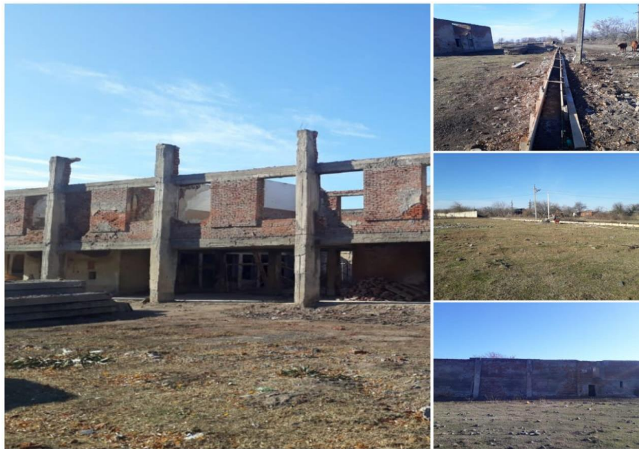
Table 4. Projects funded in 2020 - Imereti

Output results of the project - the building owned by the municipality is rehabilitated with an area of 1440 square meters. Dismantling works are currently underway. The project will be completed in 2021.