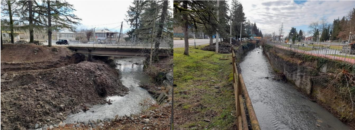
Table 5. Projects funded in 2020 - Guria