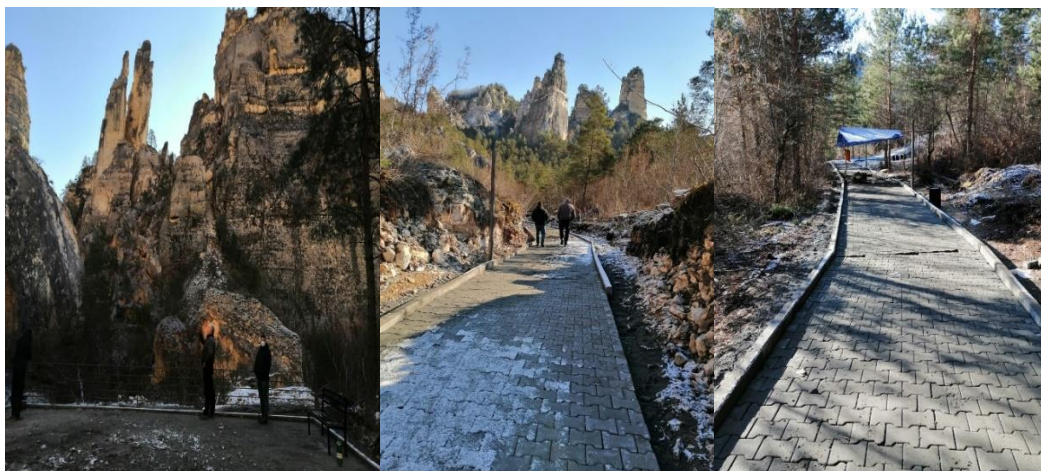
Table 6. Projects funded in 2020 - Racha Lechkhumi - Kvemo Svaneti

Output results of the project - 968 m hiking trail is arranged; 3115 sq m decorative tiles; 35-seat armchair; 4 units of viewing platform; 200 sq m parking space; 70 pieces of solar-powered diode lamp. 98% of the work has been completed by the time of preparation of this report and the project will be completed in 2020.