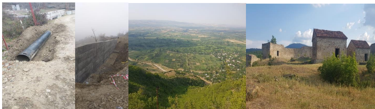
Table 3. Projects funded in 2020 - Kakheti

output results of the project - 1,664 km of road is constructed. Up to 50% of the works have been completed by this time, the works of laying the communications are underway. The project will be fully completed in 2021.